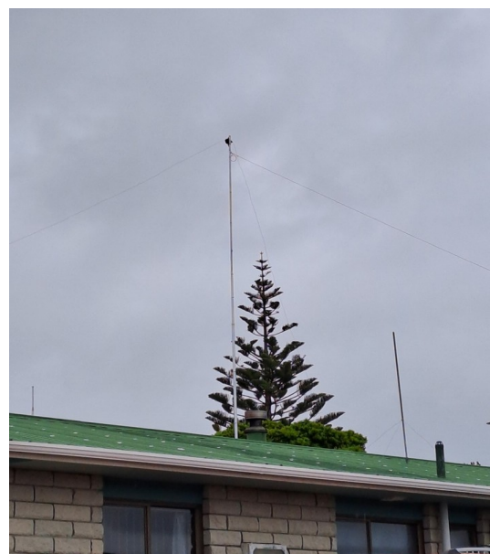
Many hands make light work Club members erecting new aerial