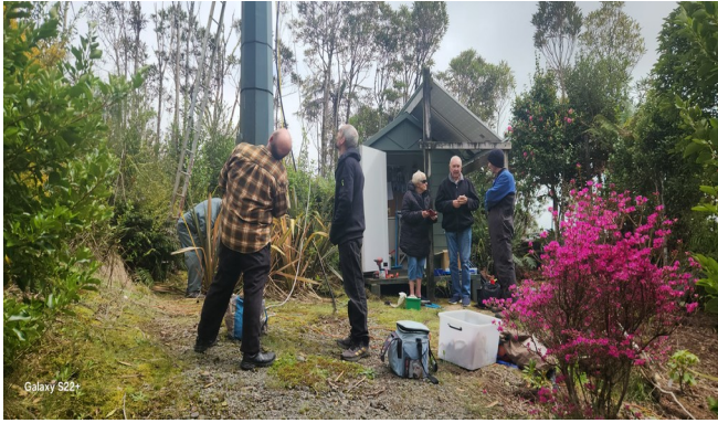
Photo of repeater site with some of the club members