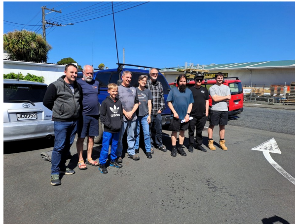
Ham cram participants