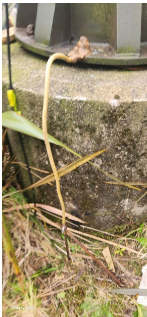
The tower is now Grounded.

Still have the VHF connector up the tower to attend to.