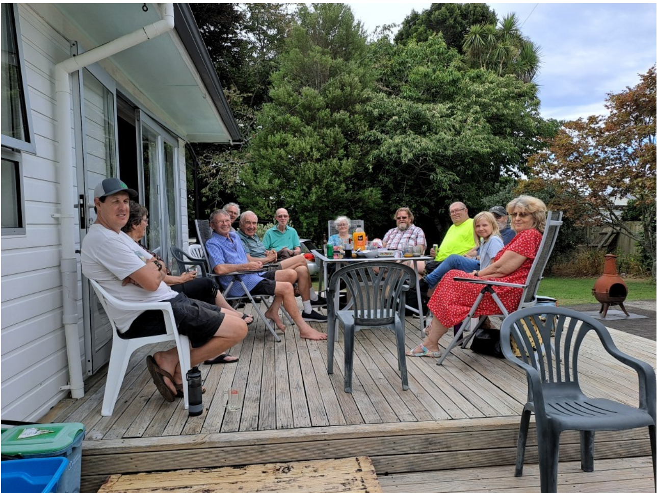
The Fox Hunt participants enjoying drinks & nibbles before the BBQ