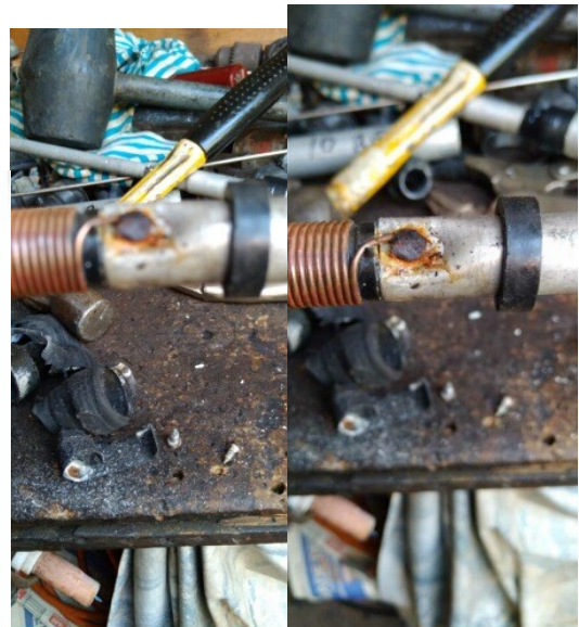
Two pictures of the corrosion in the trap

These photos depict the task faced with restoring the traps for Myrle's beam – not for the faint of heart but brilliantly repaired.